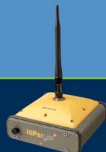
HiPer Lite+ Cable-Free Integrated RTK GPS+ Receiver

G3: GPS, GLONASS, Galileo. Triple constellation support. Universal Tracking Technology: all satellites, all signals, available now, and into the future. Only from Topcon. Welcome to the World of G3!