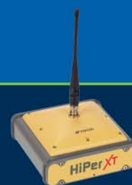
HiPer XT Wireless RTK GPS+ Receiver